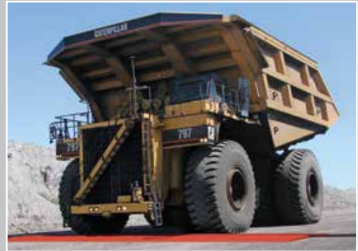
240-ton haul truck drives over an Extreme Crossover Pad